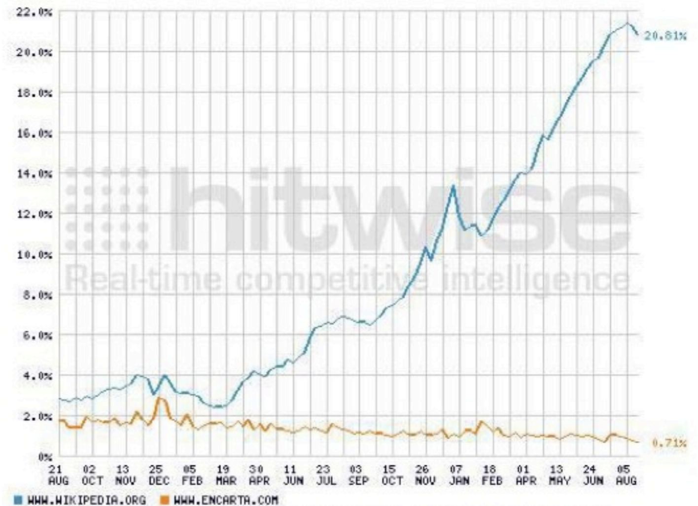
Reference 2.0: Wikipedia Soars as Encarta Dwindles

CHART OF THE WEEKLY ALL SITES MARKET SHARE IN 'EDUCATION - REFERENCE', BASED ON VISITS. TIME PERIODS REPRESENTED WITH BROKEN LINES INDICATE INSUFFICIENT DATA. GENERATED ON: 08/25/2006. COPYRIGHT 2006 (C) 'HITWISE PTY LTD'.