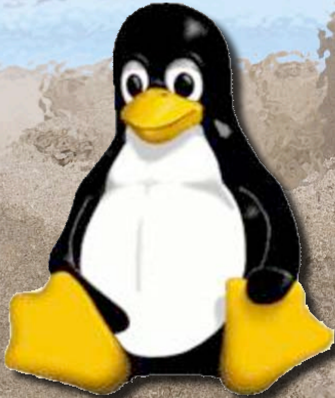
Open Source Software