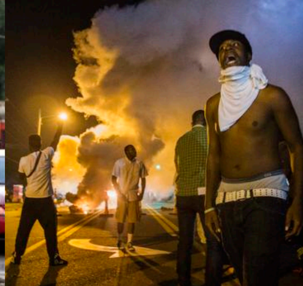
Tuesday, August 26, 14